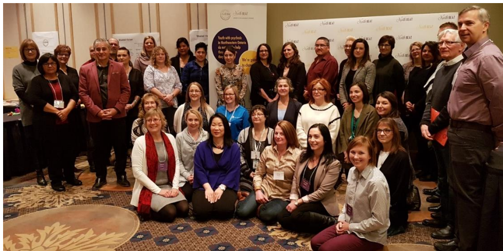
NorthBEAT Collaborative Media Launch