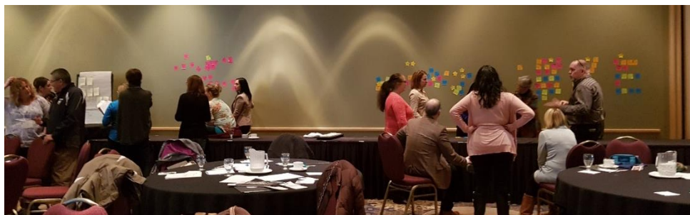
Systems charting process

Over the course of the two days, participants heard various micro-presentations about psychosis and best practices in Early Psychosis Intervention (EPI) and the context within which the NorthBEAT Collaborative exists. Participants also participated in networking and system charting activities, and attended the media event where the funding for the NorthBEAT Collaborative was officially announced. Click here to view the media release.